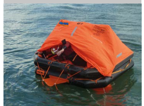
Closed and secured within seconds

Sea-Safe ProLight PL OFFSHORE CLASSICAL LIFERAFT